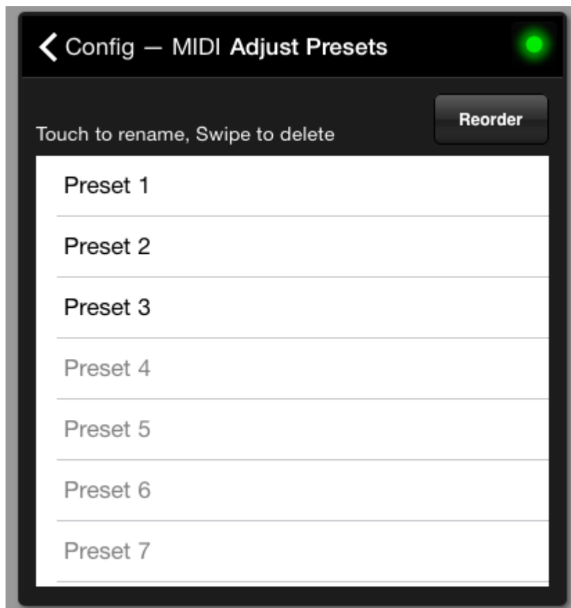
Adjust Preset Pane