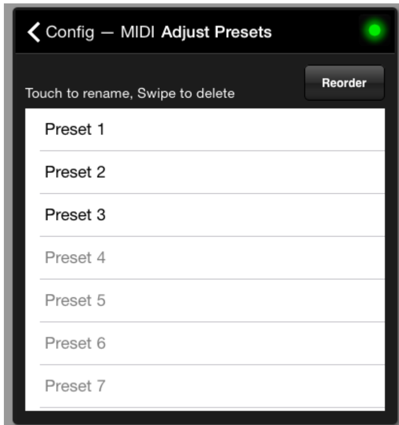
Adjust Preset Pane